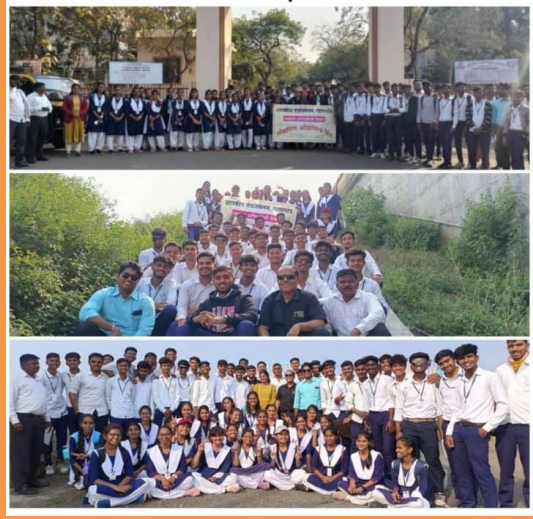
" Visit to Khadakpurna Dam "